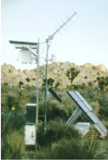
Solar-Powered Installation at Joshua Tree National Monument

The Optec NGN-2 integrating nephelometer employs a unique open-air design that allows accurate measurement of the scattering coefficient ( b_{\text{scat}} ) of ambient air. With a direct, unobstructed path from the outside air to the optical measuring chamber, modification of the temperature, relative humidity, aerosols, and gases of the sampled ambient air are minimized. Using technology developed for the Optec LPV transmissometer, the NGN-2 features low power consumption, a rugged compact design, and easy installation and operation. The instrument is ideally suited for remote monitoring.