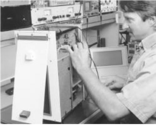
Service of the NGN-2 Nephelometer

Once installed, minimal operator intervention is required. The CMOS computer controls all operating functions of the NGN-2 as defined by user-selectable monitoring program protocols. Periodic clean air (zero) and span gas calibrations are automatically performed and logged to document instrument response. No adjustments to the zero and span values are required. The operator, however, must install a new lamp every 750 operational hours. This task is easily performed. Factory-authorized preventive maintenance is suggested approximately once per year.