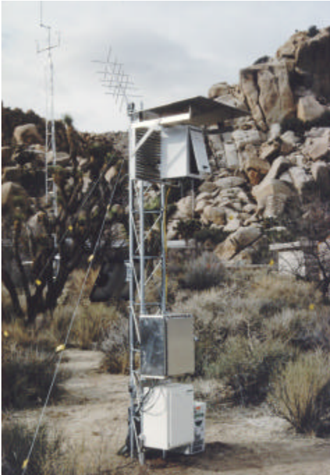
Line-Powered Installation at Amboy, California Project MOHAVE Special Study

by instrument-related modification of sampled air due to sample chamber heating, aerosol sizing by the inlet, large scattering angle truncation error, poorly-defined optical response, and unstable electronics.