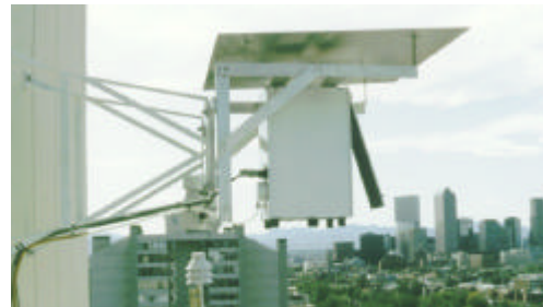
Urban Installation Denver Visibility Monitoring Instrument Intercomparison Tests

Scattered radiation from an illumination source is integrated over a large range of scattering angles, in a defined band of visible wavelengths. Because the total light scattered out of a path is the same as the reduction of light along a path due to scattering, the integrating nephelometer gives a direct estimate of b_{\text{scat}} . Nephelometer concepts were developed during World War II, and commercially available instruments have been used in monitoring programs for the past twenty years. However, as documented by many researchers, a number of severe limitations compromise b_{\text{scat}} data collected by these instruments.