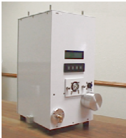
NGN-3 PM 2.5 Size-Cut and Heated Nephelometer