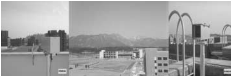
Fig. 2. Calibration sites and scenic data for the atmospheric condition during the transmissometer calibration.